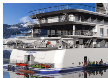
Purpose-Built & Safe Zodiac Loading