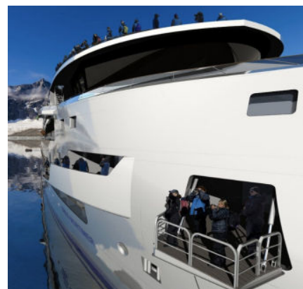
Superior Viewing Platforms